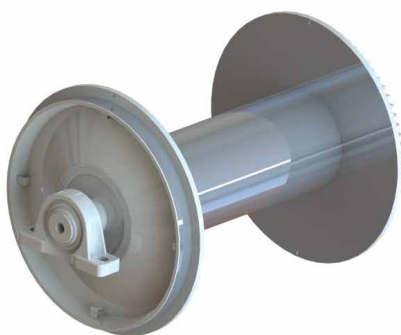
Model W06W-F24C10 (braidedline) Dimensions & Weights (excluding wire)